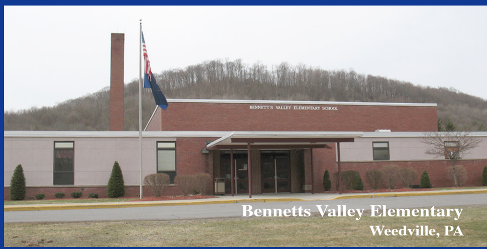
Bennetts Valley Elementary Weedville, PA