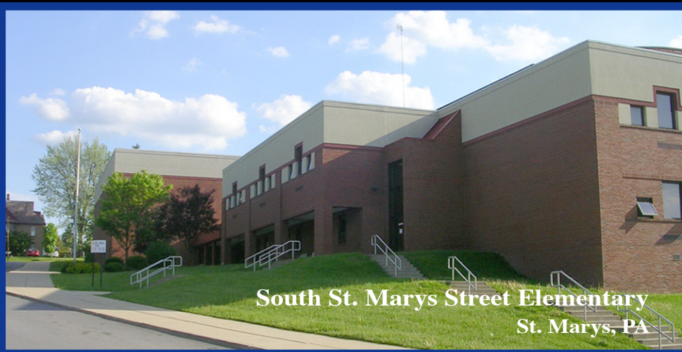
South St. Marys Street Elementary St. Marys, PA