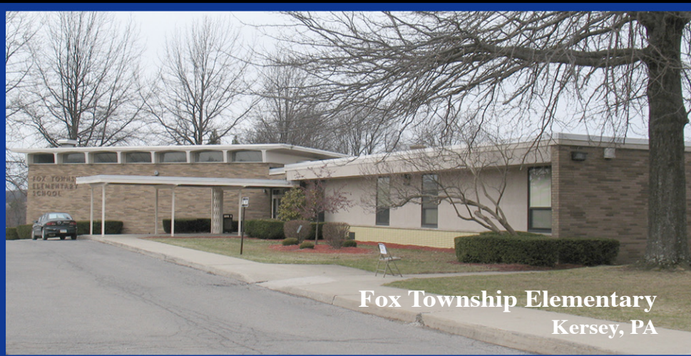
Fox Township Elementary Kersey, PA

2010/2011 Elementary School Student and Parent Handbook